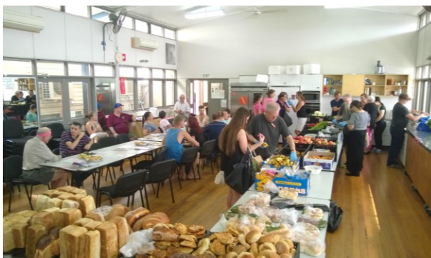
Figure 1: The emergency food relief drop-in at the community care center.

We recruited 14 participants and visited their homes for interviews. These participants were recruited during our visits to the community center's emergency food relief drop-ins. Our participants (Table 1) were diverse and included retirees (3), single parents (4), and couples with kids (2). None of the 14 participants had any kind of paid employment and they all received welfare payments from the government welfare agency, Centrelink, and regularly visited community care centers for food and financial assistance. Note that all participants had a chronic financial stress exacerbated by a variety of health and social conditions. Four of these participants had participated in an earlier study focused on household financial management within