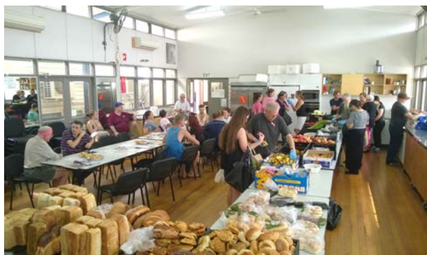
Figure 1: The emergency food relief drop-in at the community care center.

We recruited 14 participants and visited their homes for interviews. These participants were recruited during our visits to the community center's emergency food relief drop-ins. Our participants (Table 1) were diverse and included retirees (3), single parents (4), and couples with kids (2). None of the 14 participants had any kind of paid employment and they all received welfare payments from the government welfare agency, Centrelink, and regularly visited community care centers for food and financial assistance. Note that all participants had a chronic financial stress exacerbated by a variety of health and social conditions. Four of